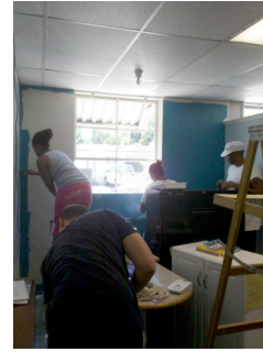
Many thanks to volunteers from Beale AFB who spent a weekend painting four rooms at Hands of Hope.

Hands of Hope P.O. Box 88 Yuba City CA 95992